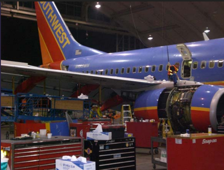
To the left a Southwest Airlines 737-700 undergoing a "C" Check at the Maintenance Hangar in MDW