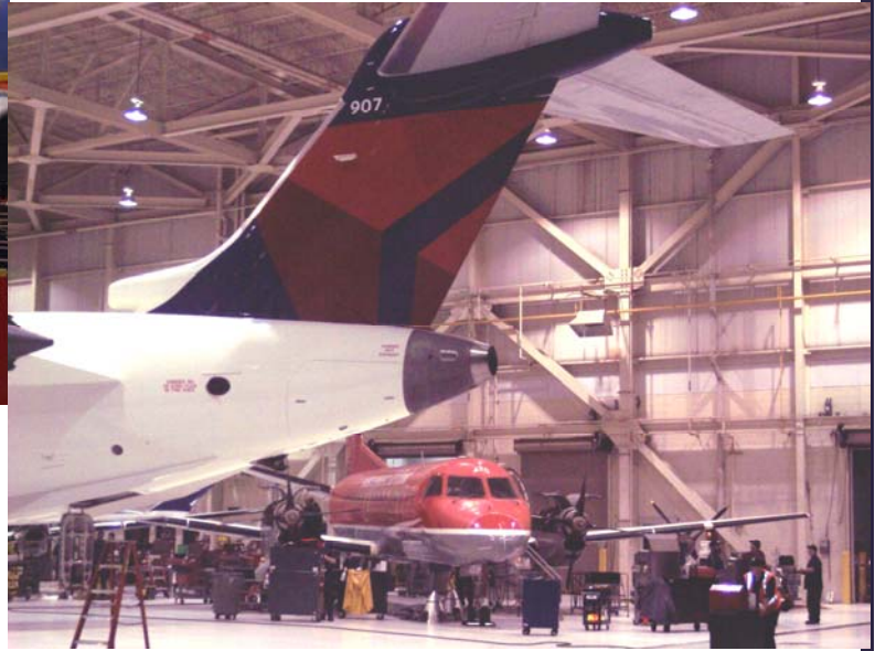
To the right a Mesaba Airlines SAAB 340 is being worked (backset) during a RON visit at the DTW Maintenance Hangar. Pictured in the front is the empennage of a CRJ-900 with the Delta Connection livery